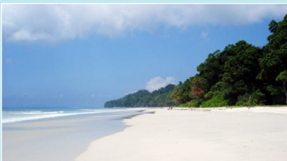
Radhanagar beach in Andaman and Nicobar Islands